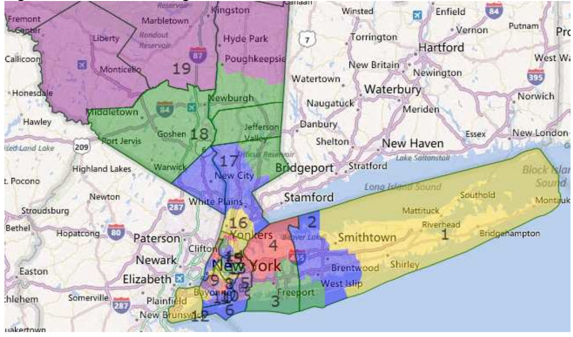
Figure 1. The Downstate Region:

Contained entirely within the borders of Erie County, this district covers the core of the Buffalo metropolitan area.